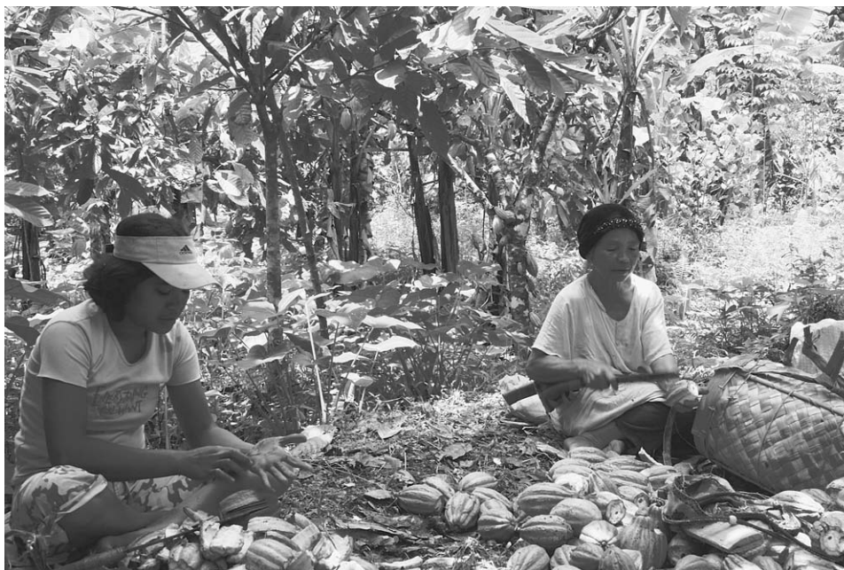
PLATE 1. Harvest in a cacao plantation in Central Sulawesi, Indonesia. Particularly in such traditional agroecosystems, fruit abortion can blur the benefits from enhanced pollinator services.

tree level for coffee and cacao and at the site level for passion fruit, our experimental setup could not detect effects of within-plant relocation of nutrients. This is a limitation of most pollen supplementation experiments (reviewed by Knight et al. 2005) and can be accounted for by conducting studies at multiple scales combined with fertilization experiments.